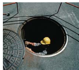
SUBGRADE UTILITY USE