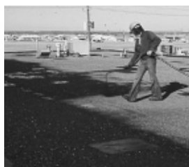
PRIOR TO COATING