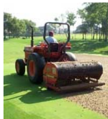
GOLF COURSES & LANDSCAPERS