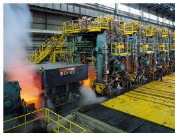
High Heat Applications

SWEPCO 104 provides safe, dependable lubrication at constant temperatures up to 300°F. (149° C) and