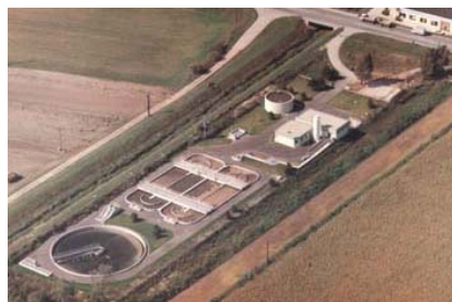
WWTP & Other Corrosive Environments

This highly effective moly film provides an extremely durable second layer of lubrication which reduces friction and drag well below levels